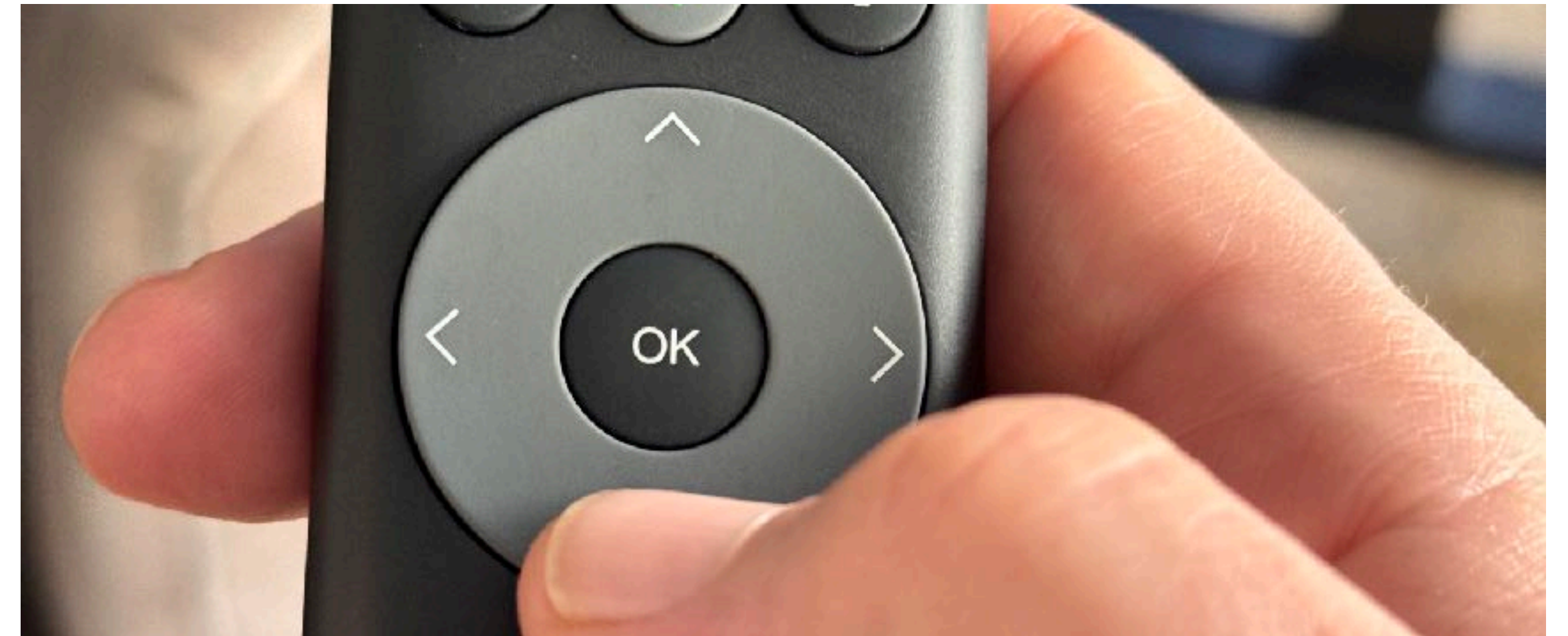
4) MOVE WITH ARROWS TO THE BLUE TV APP