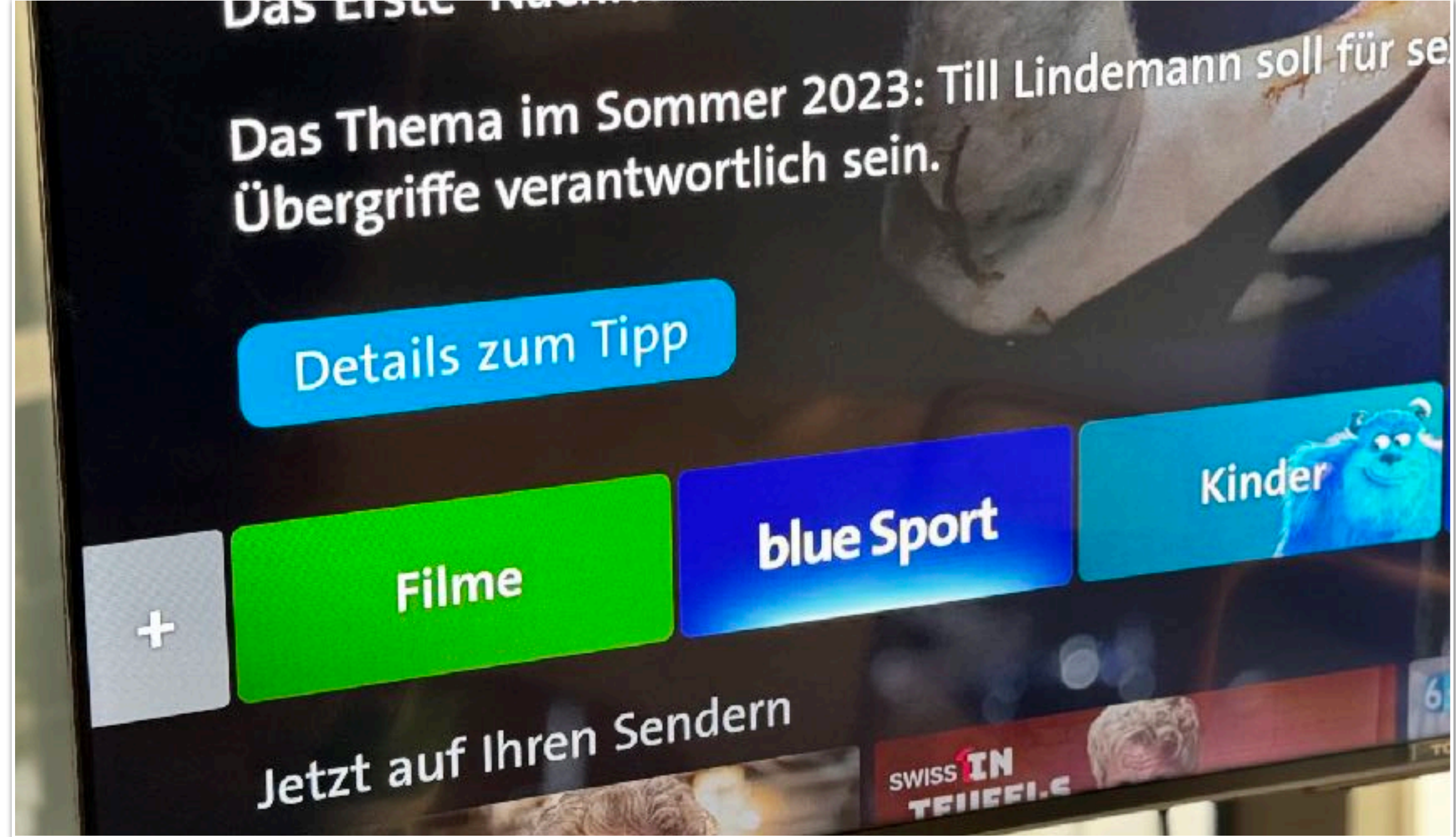
5) SELECT BLUE SPORT USING THE ARROWS