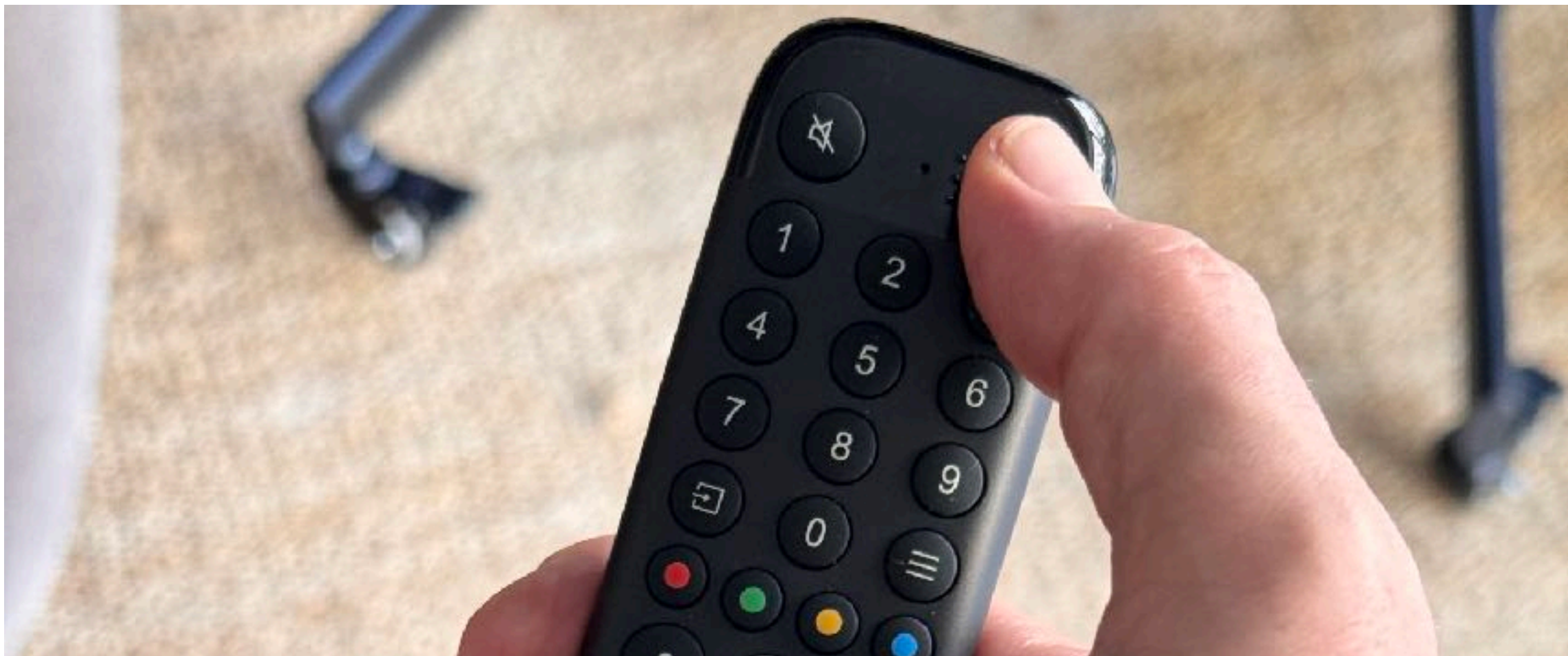
2) TURN ON THE TV