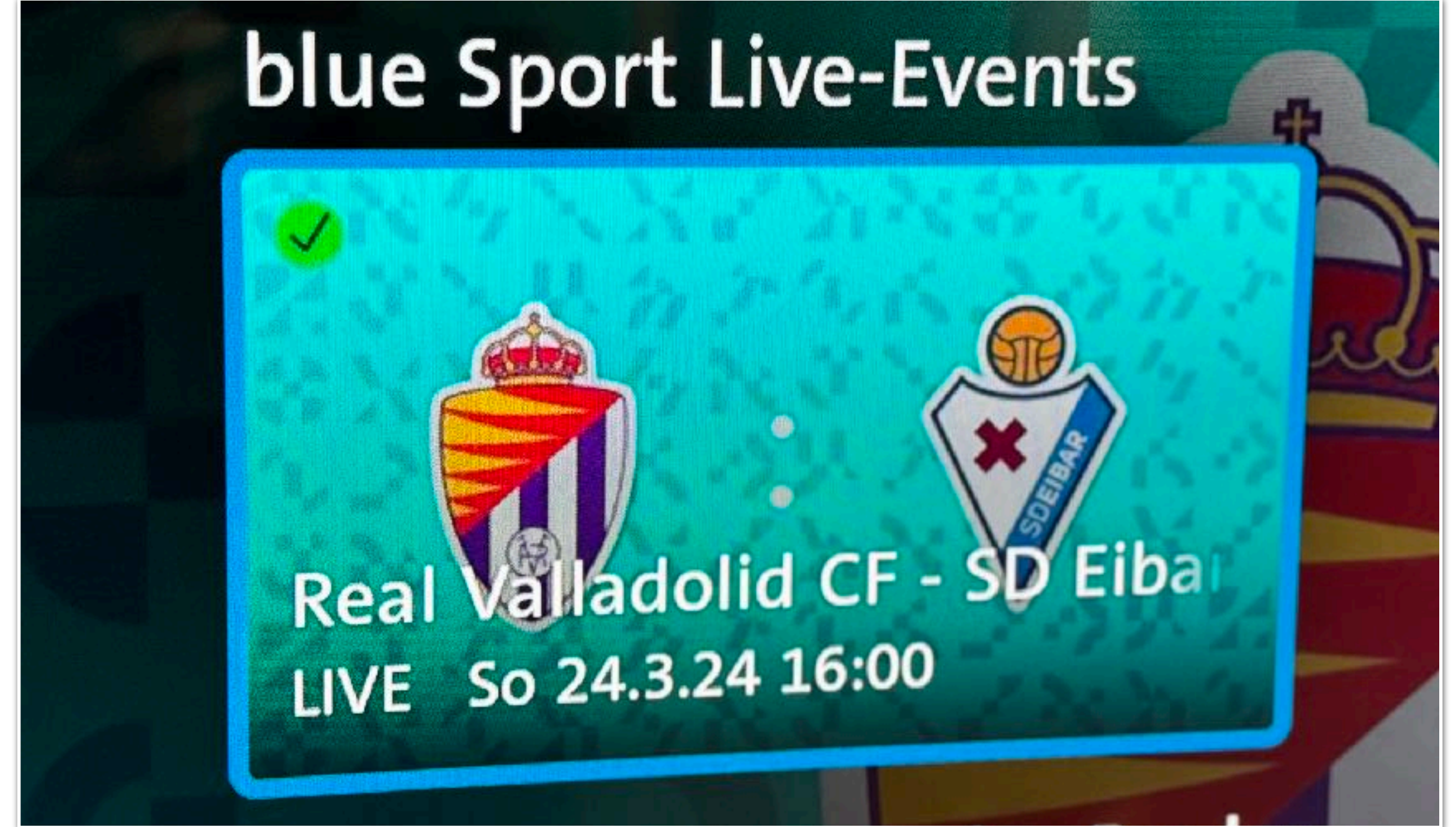
6) SELECT THE GAME YOU WANT TO WATCH