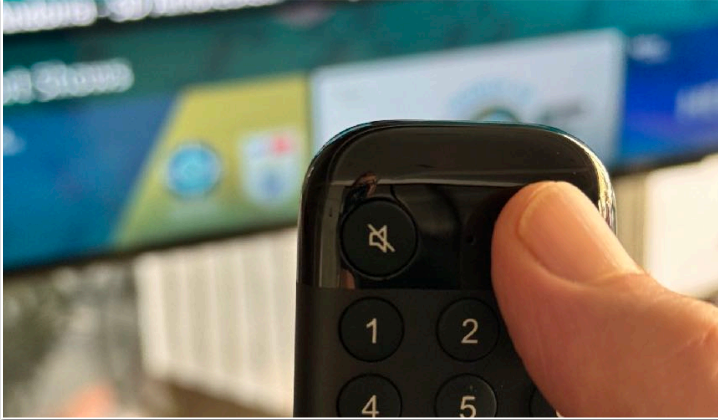
1) TURN OFF THE TV