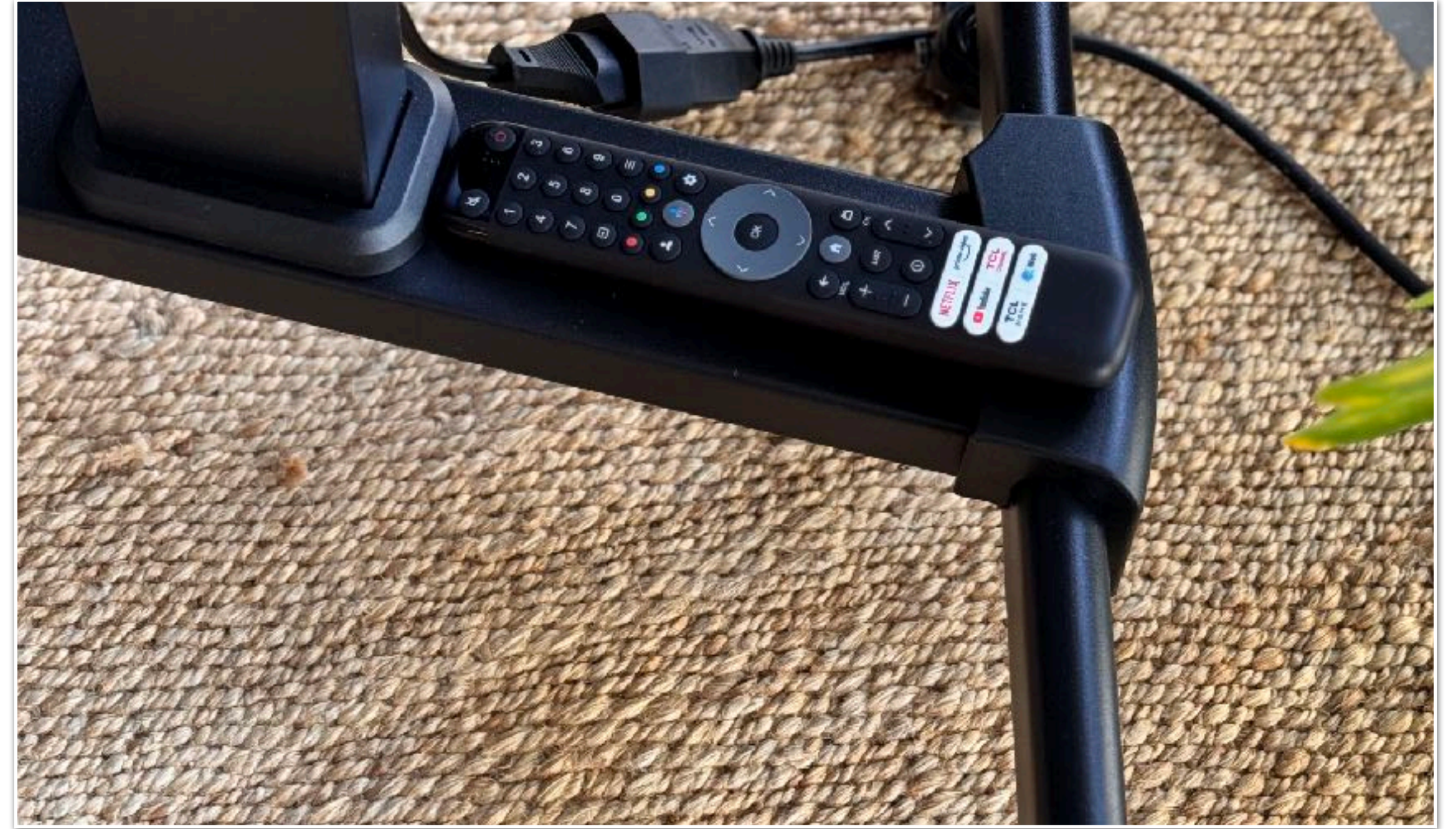
2) PUT THE REMOTE BACK WHERE IT BELONGS