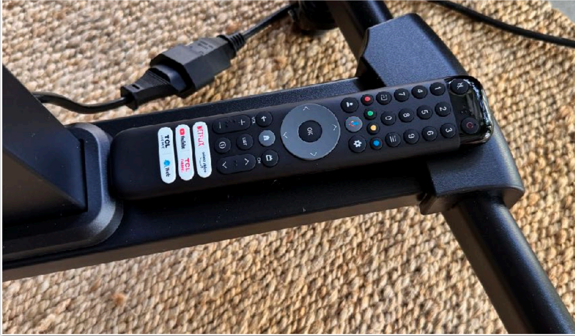
1) FIND THE REMOTE