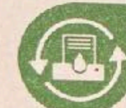
TINTENPATRONEN & TONER