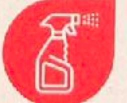
LÖSUNGSMITTEL & SPRAYS