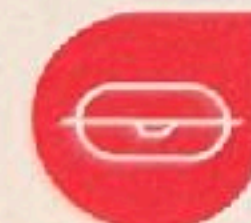
VERSCHMUTZTE KUNSTSTOFF-VERPACKUNGEN FÜR LEBENSMITTEL