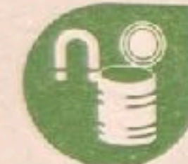
WEISS- & STAHLBLECH