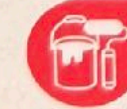
LACKE & FARBEN