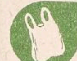
FOLIEN ALLER ART