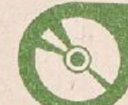
CDs & DVDs