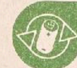
BATTERIEN & AKKUS