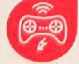
ELEKTRONISCHE GERÄTE, DIE NICHT IN DIE TASCHE PASSEN