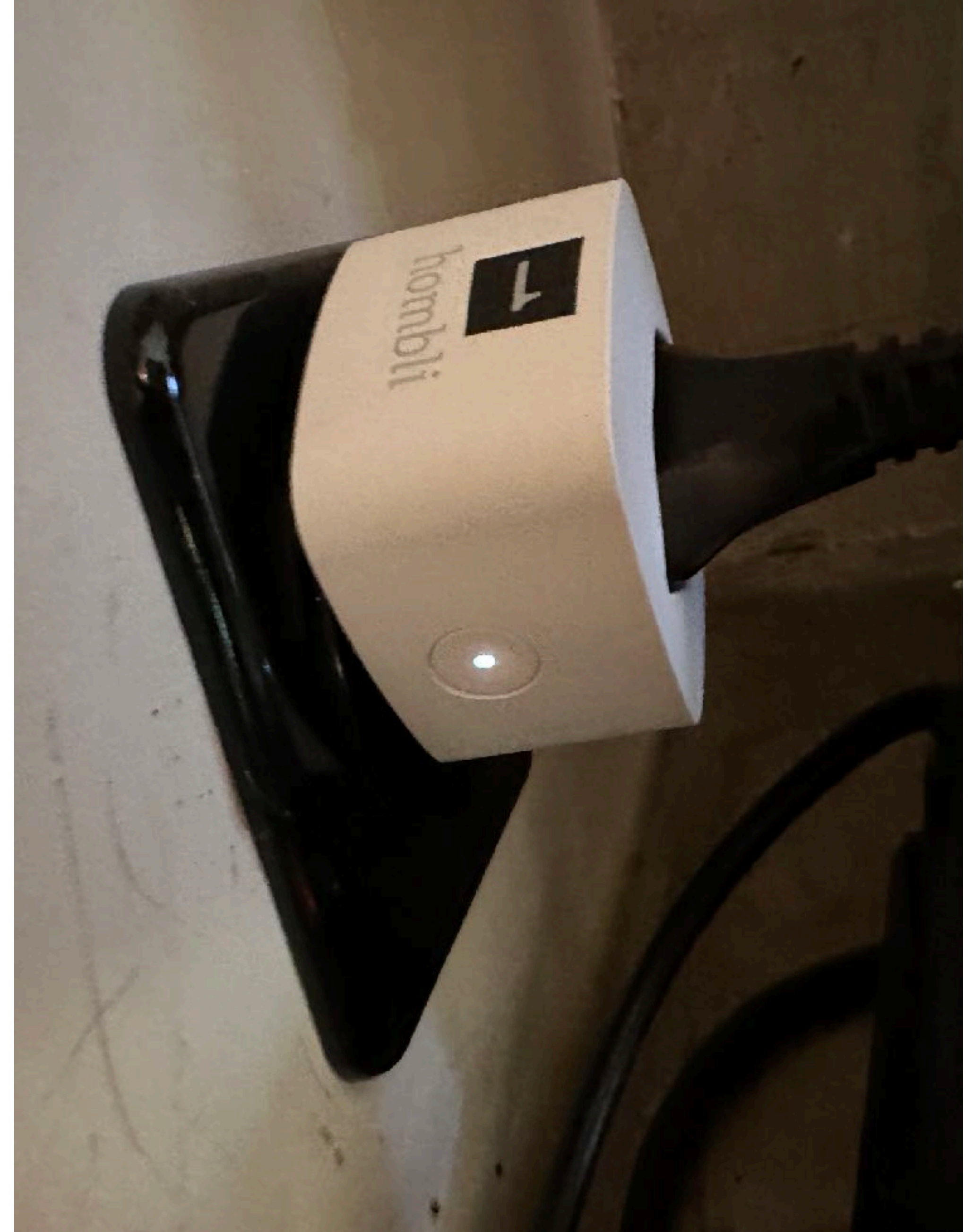
3) THERE IS A SMALL BUTTON TO OVERRIDE