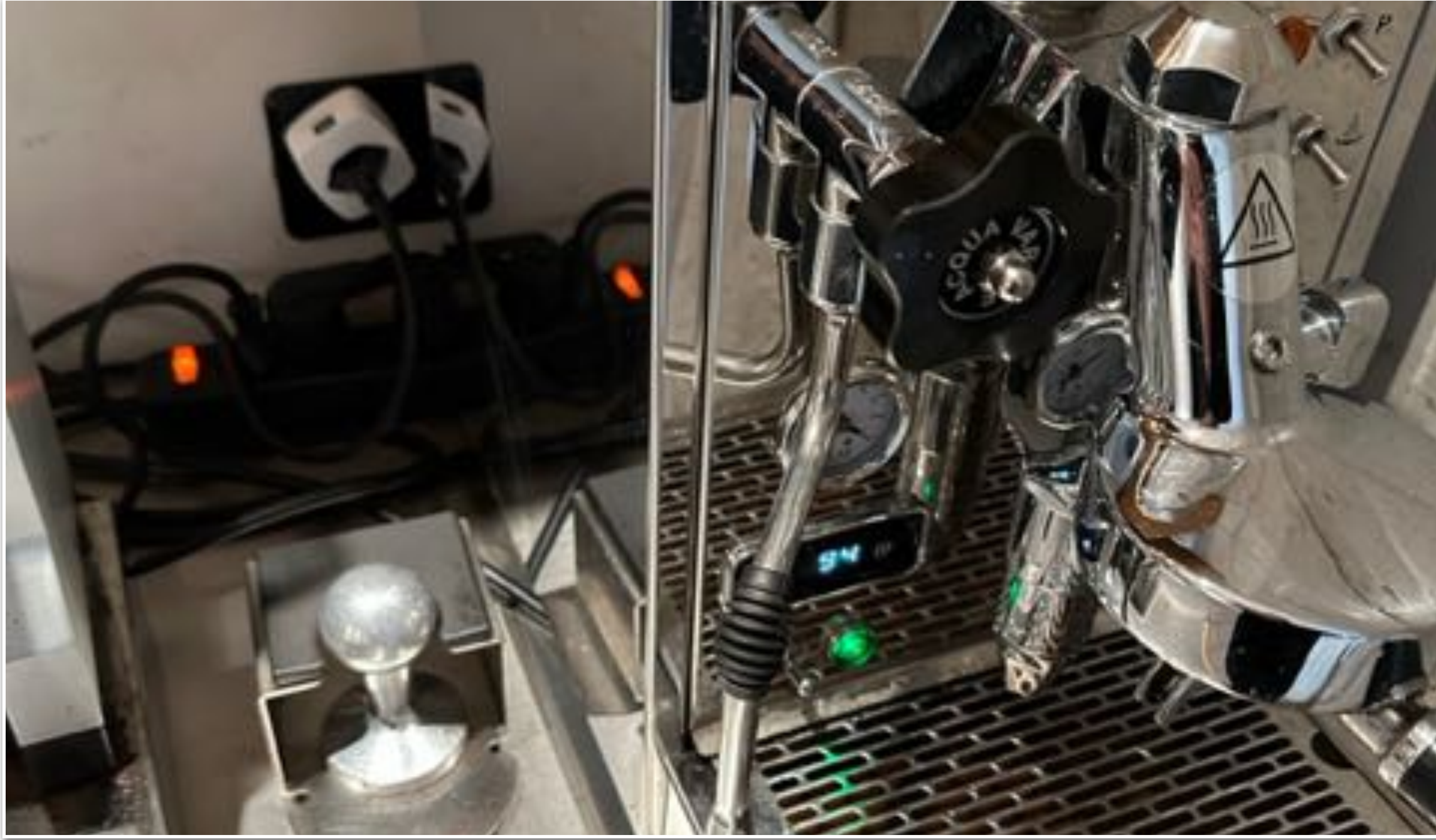
1) SMART SOCKETS ARE USED FOR THE COFFEE SETUP